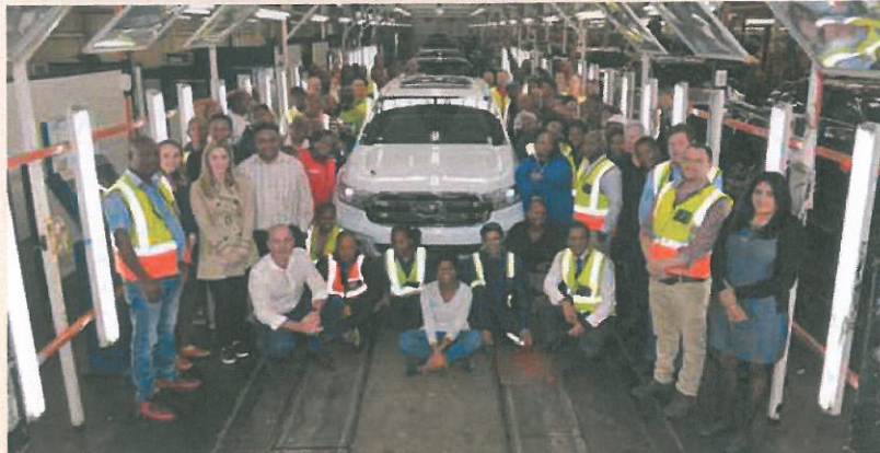
New production of the Everest SUV has kicked off at Ford's Silvertown assembly plant in Pretoria.

NEW production has begun on the Ford Everest range.