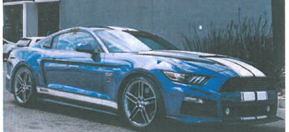
Select Roush performance upgrades are now Ford approved!

THE demand for Ford Performance and Roush Performance parts and conversion kits from their new place in Centurion is proving very strong and in some cases, demand is outstripping supply.